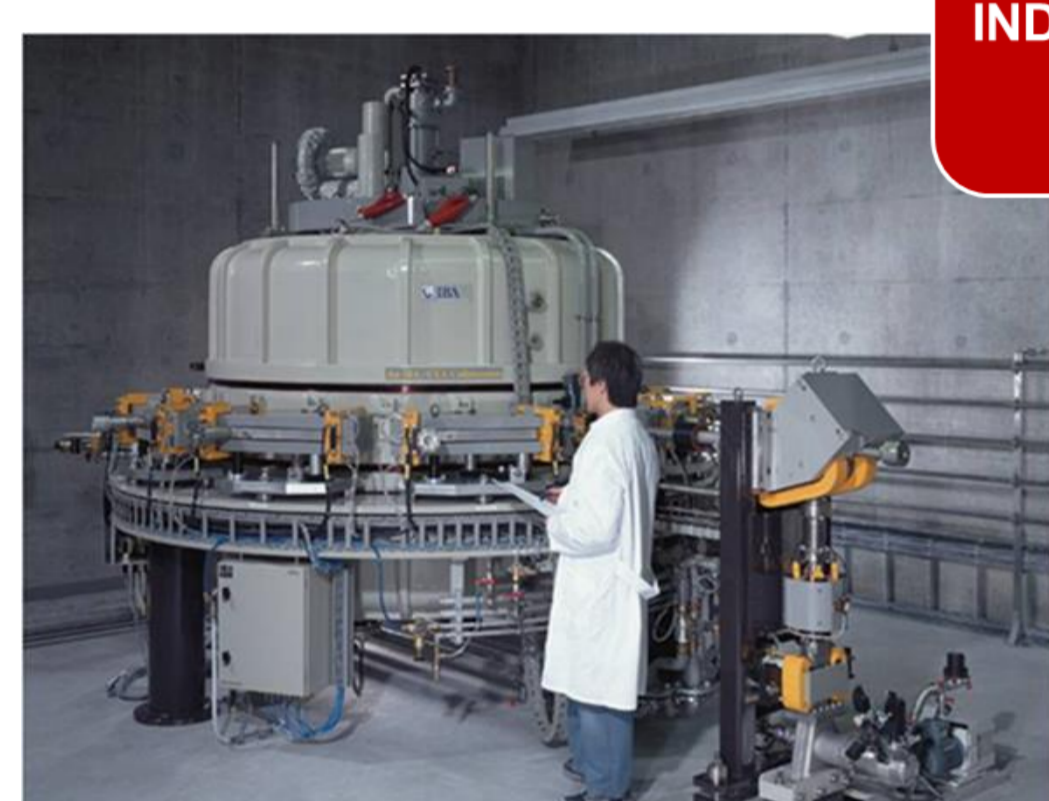
10 MeV IBA rhodotron