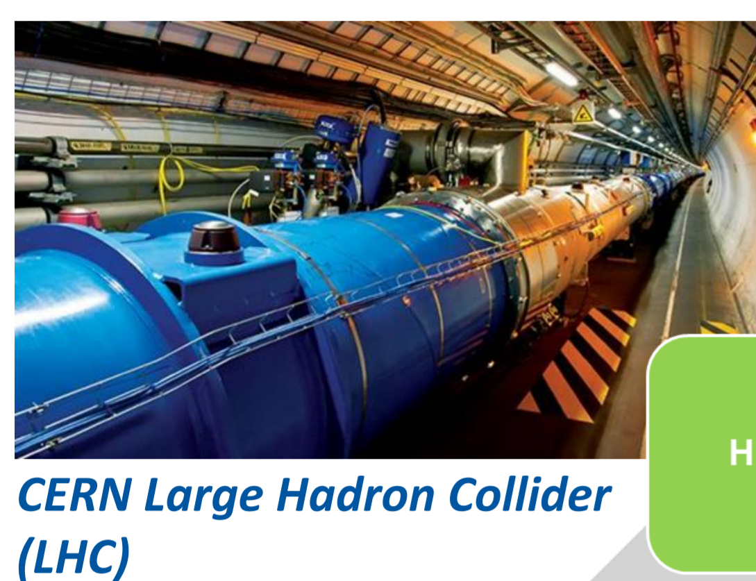
CERN Large Hadron Collider (LHC)