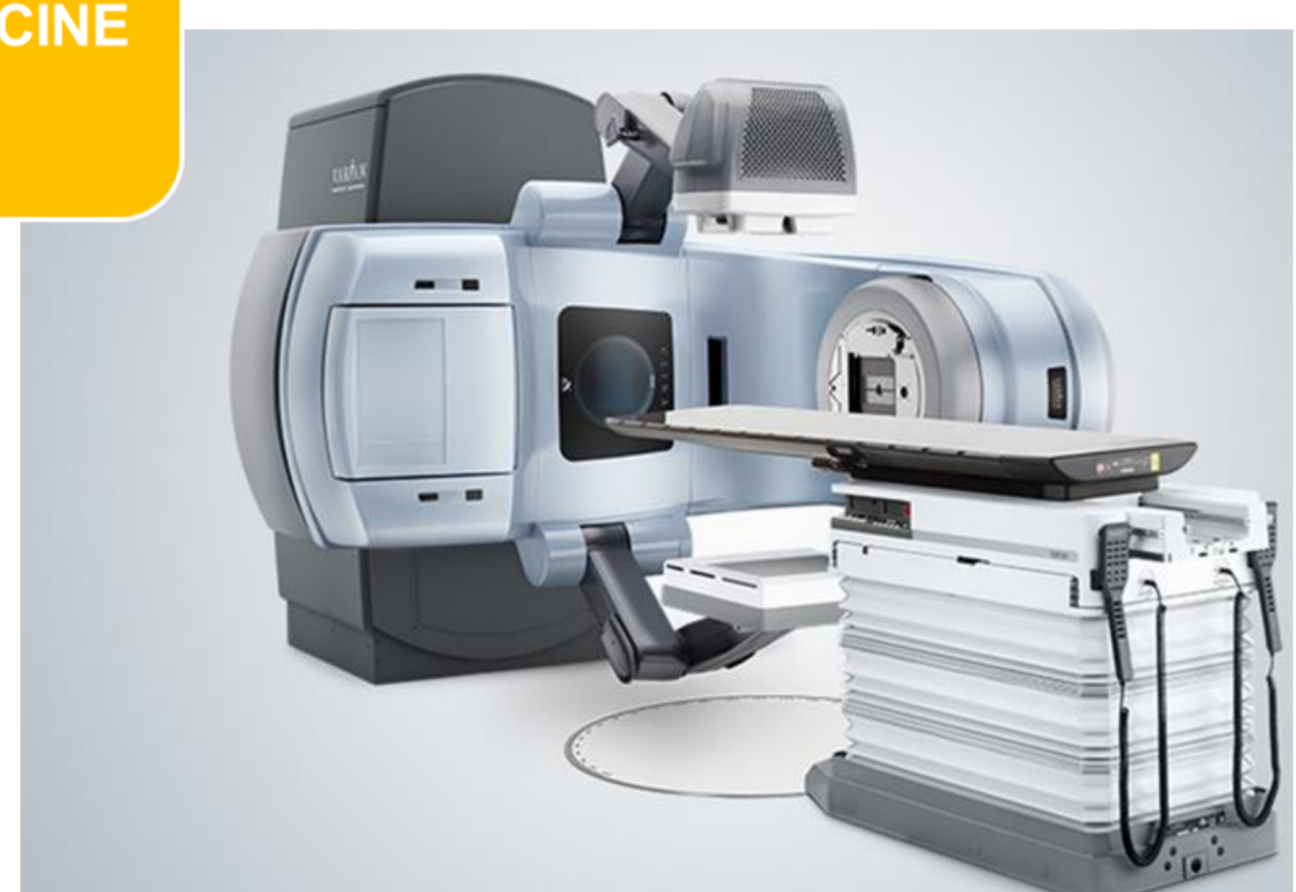
Clinac® iX System linear accelerator