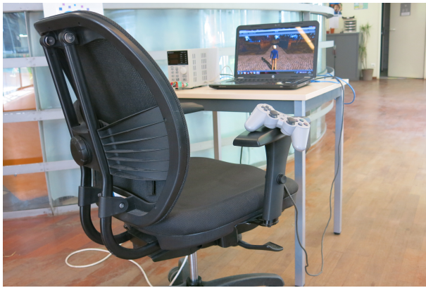
Fig. 1. Picture of the Virtual Promenade system setup.

is an affordable and easy to repurpose solution, as speed can easily be controlled by varying the the motor's input voltage. A picture of the chair and the whole Virtual Promenade system is presented on Figure 1.