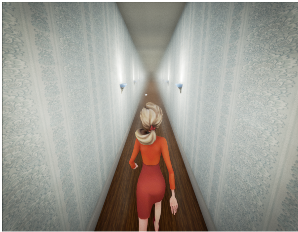
Fig. 2. Screen capture of the software used for the preliminary study