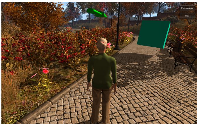
Fig. 4. Screen capture of the Virtual Promenade game in the Park environment.