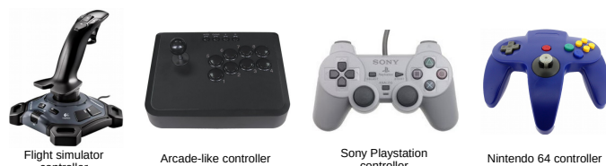
Fig. 5. Pictures of the game controllers we experimented with.